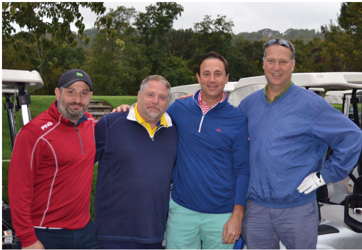
Above: Players enjoyed a competitive game, on-course challenges, and lots of Crusader camaraderie at LH’s Golf Outing October 8 at Great River Golf Club in Milford. Thank you to all who came out to support the event!