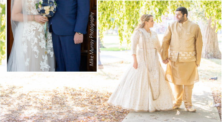
Shades Shutters Photography