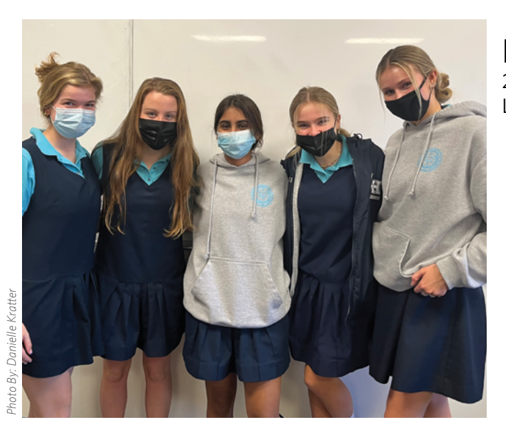
Lauralton Hall 200 High St, Milford, CT 06460 LauraltonHall.org

NONPROFIT ORG US Postage PAID PI #447 New Haven, CT